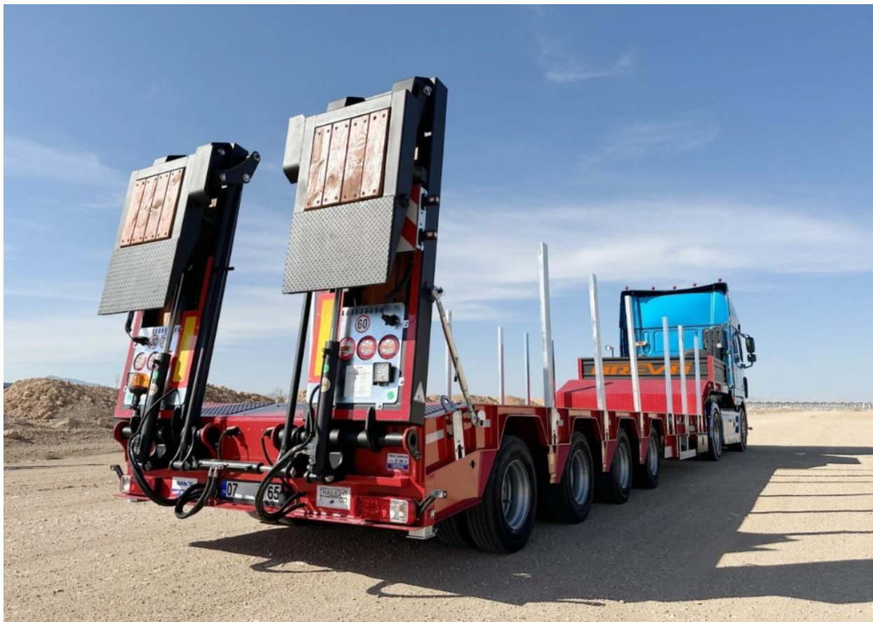
BREVA four-axle low-bed semitrailer with extension.