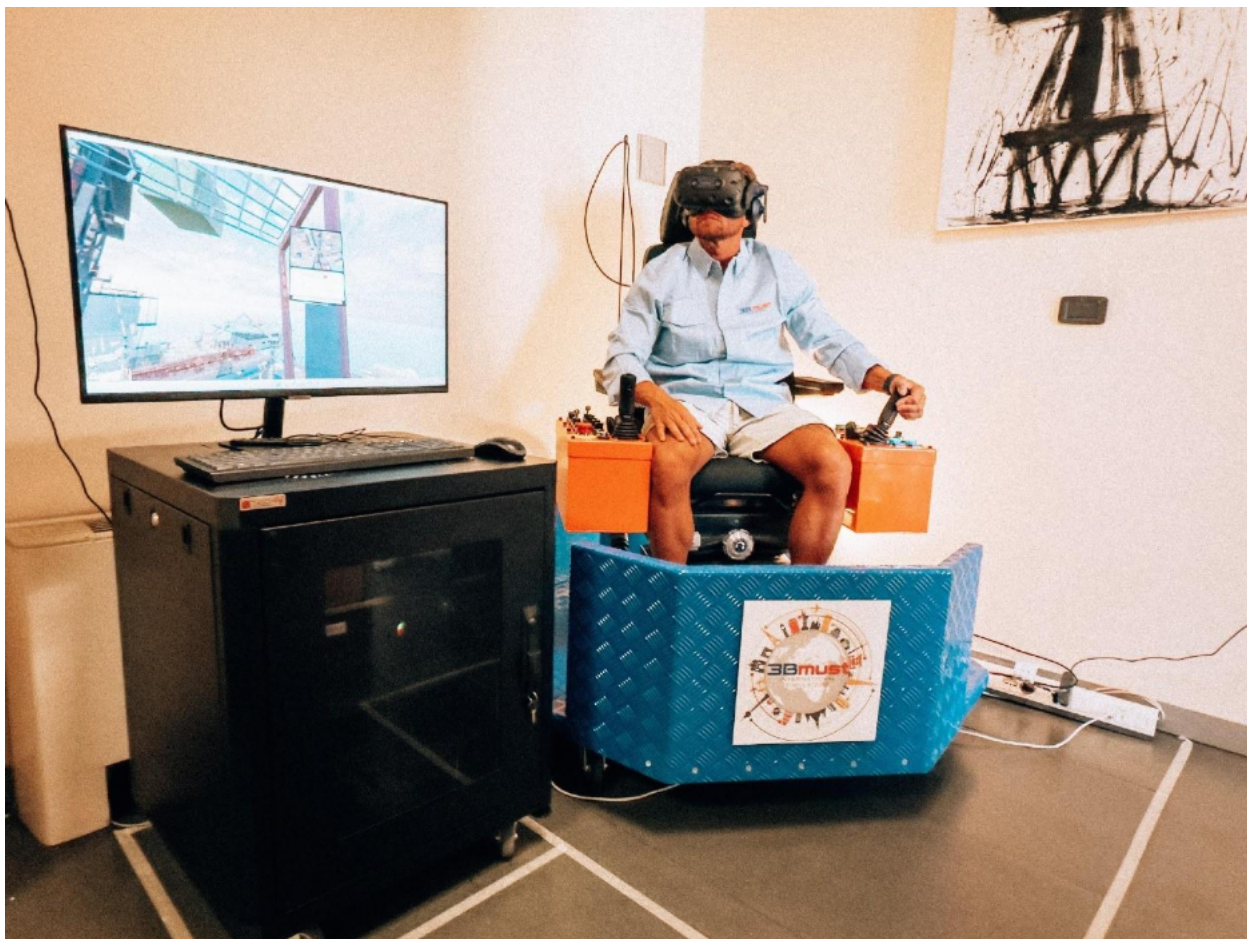
3Bmust International's virtual reality crane simulator in action.